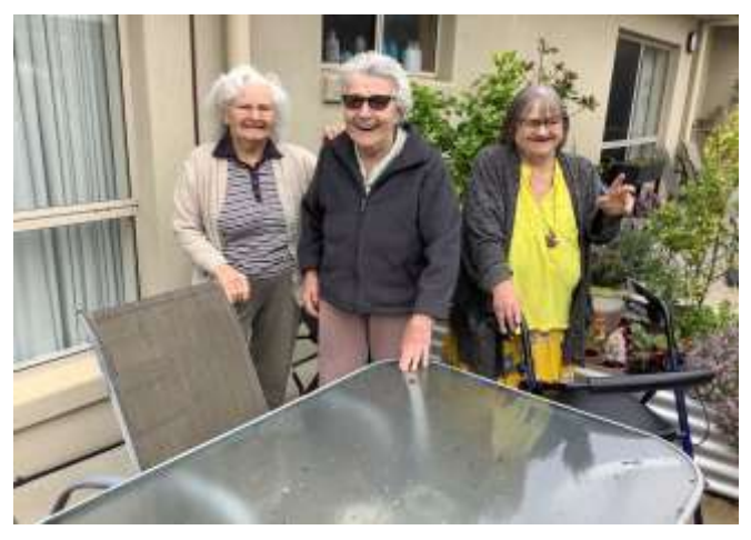
Residents of Estia Health, Long Gully enjoying the garden